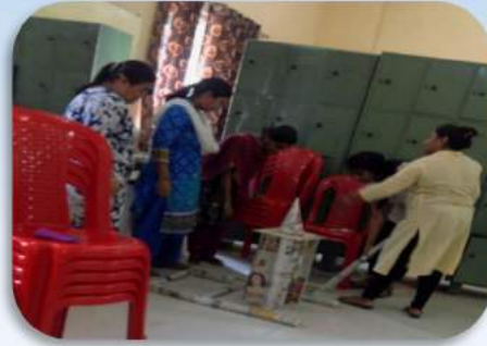
STUDENTS WHILE BUILDING A TOWER