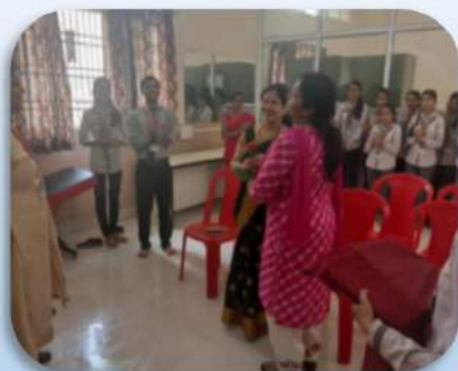
SPA & WELLNESS OPENING UNDER WDC

To empower girls with necessary life skills and to work towards bridging the gender gap, Women Development Cell was set up. The Women development cell organized debate competition, poster competition and rally on Beti Padhao, Beti Bachao. For self grooming up of the students, special beauty advisory session of 40 hours is started in the month of March, 2019.