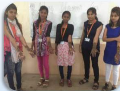
PARTICIPANTS OF MEHANDI COMPETITION