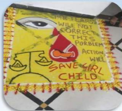
RANGOLI MADE BY TY STUDEN