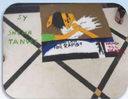
RANGOLI BY SY STUDENTS

Rangoli competition is organized by Women Development Cell in college building on 09 th Sept. 2017. 'Rangoli' Competition was held in college campus. Competition was held on Saturday and started at 10am, that included the participation of students belonging to F.Y., S.Y., and T.Y.B.com. At Rangoli competition, Rangolis were the one relating to women's life. They all have participated very well and expressed feelings of Anger, Exploitation, Sorrow, Happiness through their Rangoli. They show their skills and talent in Rangoli and grab the opportunity to speak about various problems faced by the women/ girls in the society.