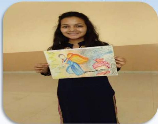
WINNER FOR POSTER COMPETITION

Poster Competition organized by WDC unit on Date 23 rd Aug. 2017 . Posture making competition was held at college campus . The participants in such competition where the members of the committee itself. The competition was started at 11 am onwards. The posture making competition was based on the topic: "Status of Women's in Indian society". All the participants contributed different variety of views on the women's status through their postures. The program was regulated by WDC members .