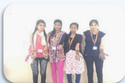
SHOWING MEHANDI TO JUDGE

'Mehendi Art competition was held on 07 Sept 2017. in college campus on Saturday at 11 am. All the participants gathered in S.Y.B.Com's classroom for the competition. All were instructed to strictly stick to the time. Spiritually, Henna is believed to bring happiness, good fortune and benevolence of the Universe. Henna also acts as an anti-fungal and a preservative. They have given 1 hour to complete the mehendi design and after that they have to present it. They have shown their skills and ability.