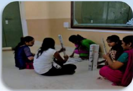
STUDENTS PARTICIPATING IN ACTIVITY

The 'Group Building' Activity was held on 11 th Sept.2017 in college campus. Competition started on 2pm and ended by 3pm that included the participation of students from Spa Management. At Group Building competition, they have to build longest tower with the help of old newspaper. They divided themselves in to 3 groups Named it as "Hum Paanch", "Paanch Tatava" and " 5Star".