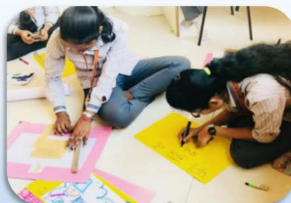
STUDENT MAKING POSTER