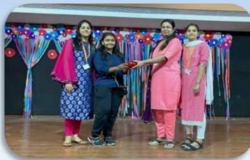
STUDENTS ENJOYING ZUMBA & FELICITATION OF TRAINER