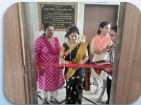
SPA AND WELLNESS CENTRE INAUGURATION