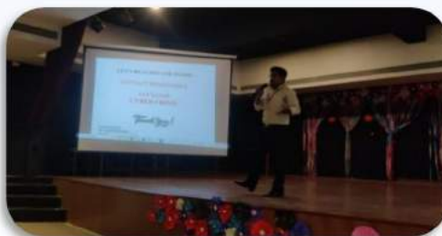
PRESENTATION ON AWARENESS ON CYBER SECURITY