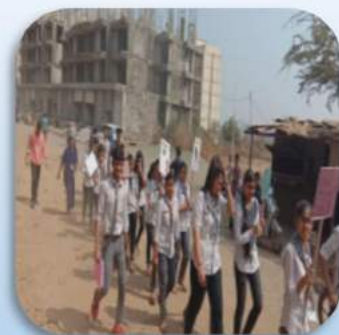
RALLY FOR BETI BACHAO BETI PADO